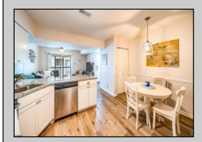
4344 West Ave Ocean City, NJ 08226