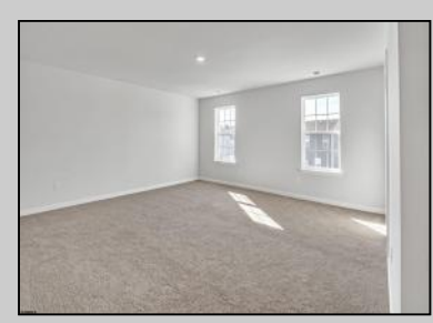
12 Winchester Ocean View, NJ 08230