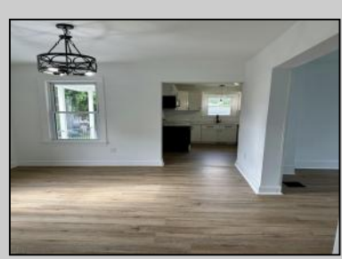
920 Michigan Vineland, NJ 08360