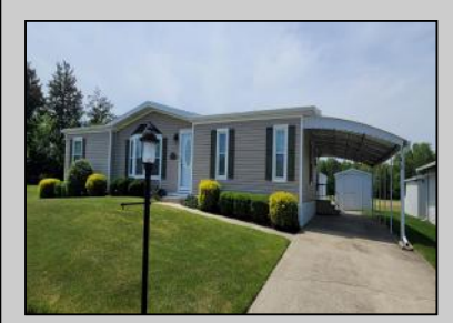
285 Mayflower Buena Vista Township, NJ 08310