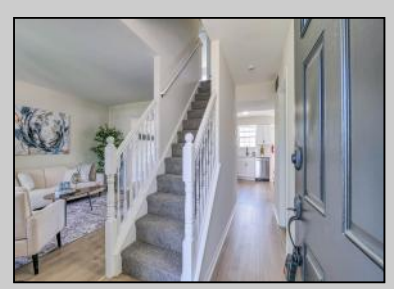
400 Poplar Ave Galloway Township, NJ 08205