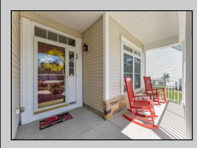
24 Marigold Cir Egg Harbor Township, NJ 08234