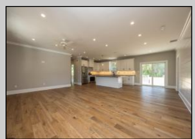
1840 Route 9 Ocean View, NJ 08230