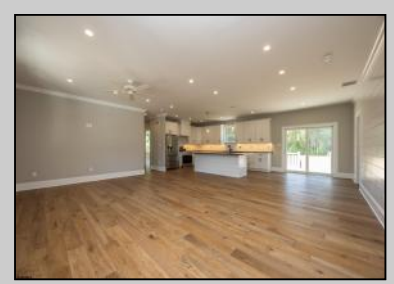
1840 Route 9 Ocean View, NJ 08230