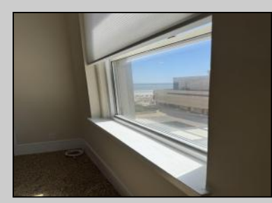
2715 BOARDWALK UNIT 402 Atlantic City, NJ 08401