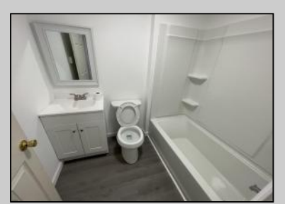
711 First Northfield, NJ 08225