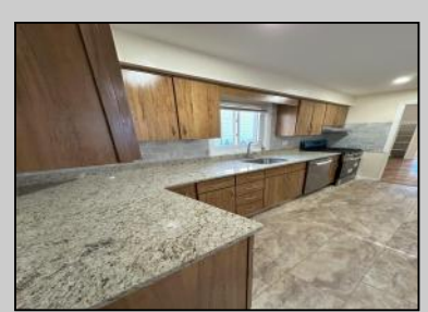
223 London Ave Egg Harbor City, NJ 08215