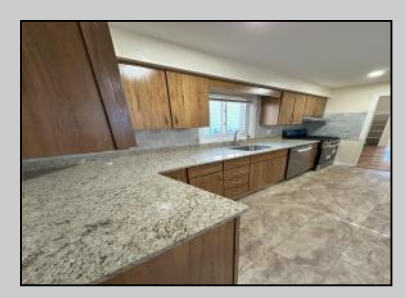
223 London Ave Egg Harbor City, NJ 08215