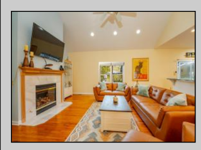
9 Scarlett Oak Cir Egg Harbor Township, NJ 08234