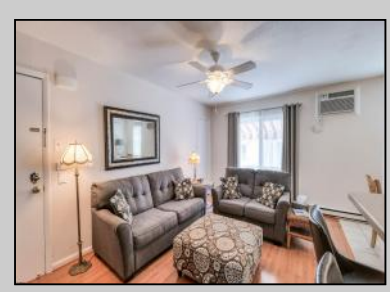
201 Coolidge Margate, NJ 08402