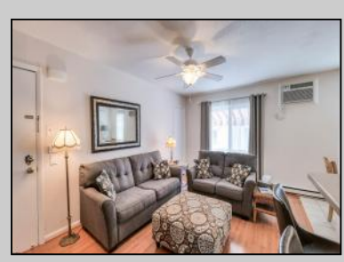
201 Coolidge Margate, NJ 08402