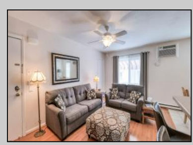
201 Coolidge Margate, NJ 08402