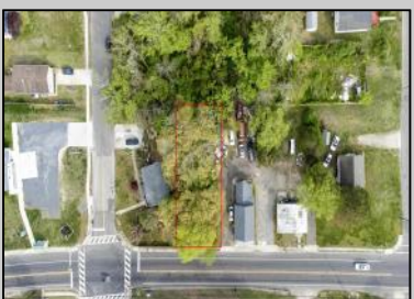
Route 9 Cape May Court House, NJ 08210