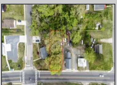
Route 9 Cape May Court House, NJ 08210