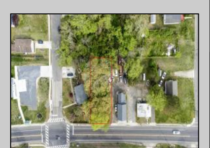
Route 9 Cape May Court House, NJ 08210