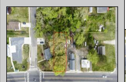
Route 9 Cape May Court House, NJ 08210