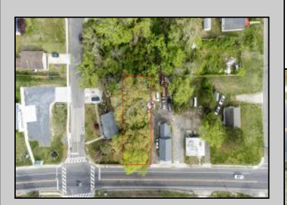
Route 9 Cape May Court House, NJ 08210