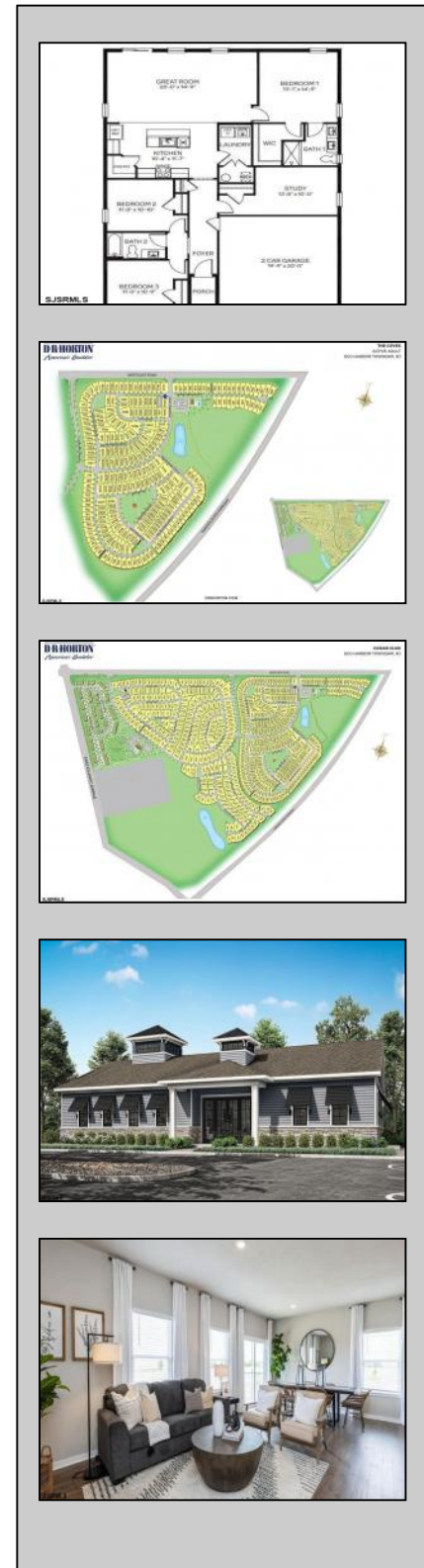
122 Hilton Head Egg Harbor Township, NJ 08234