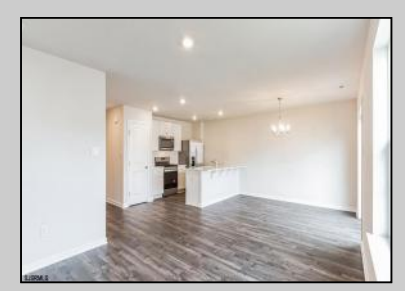
140 Hilton Head Egg Harbor Township, NJ 08234