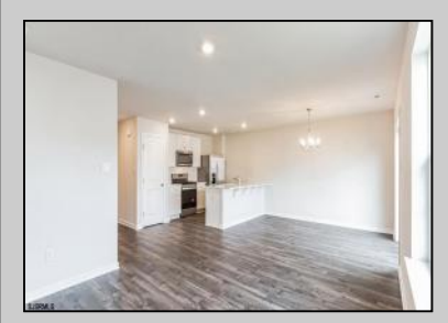
140 Hilton Head Egg Harbor Township, NJ 08234