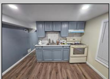
8 Montpelier Atlantic City, NJ 08401