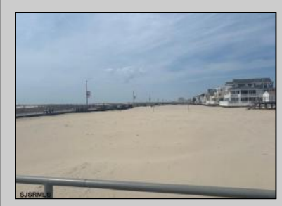
420 Berkshire Ventnor, NJ 08406