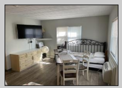
840 Ocean Ocean City, NJ 08226