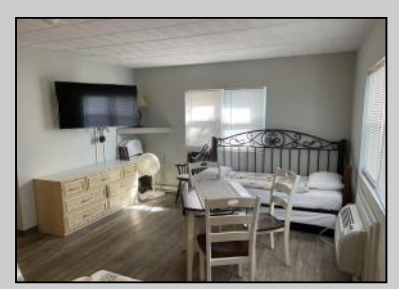
840 Ocean Ocean City, NJ 08226