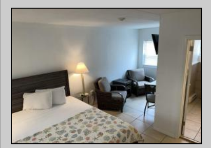
840 Ocean Ocean City, NJ 08226