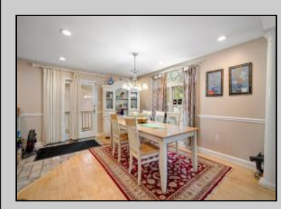
2149 SHORE Linwood, NJ 08221