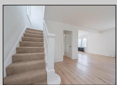
12 Hampden Ct Pleasantville, NJ 08232