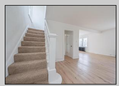
12 Hampden Ct Pleasantville, NJ 08232