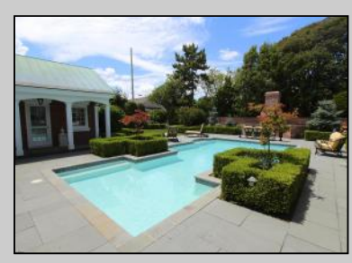
5801 Atlantic Ventnor, NJ 08406