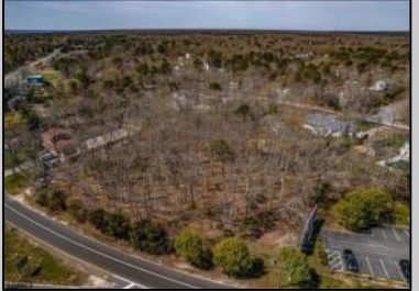
10 Rt 50 Ocean View, NJ 08230