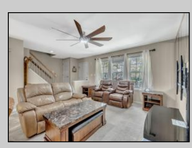
38 Lighthouse Atlantic City, NJ 08401