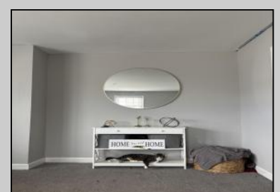
709 Dudley Ventnor Heights, NJ 08406