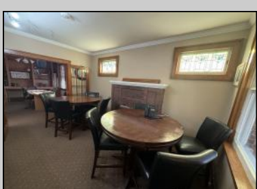
5467 Harding Hwy Mays Landing, NJ 08330