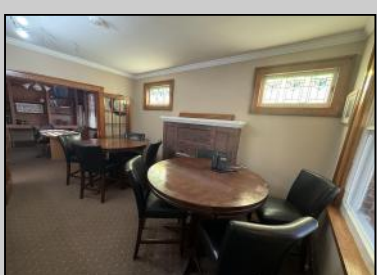
5467 Harding Hwy Mays Landing, NJ 08330