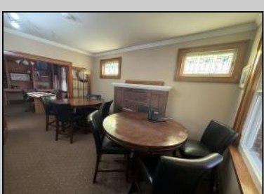
5467 Harding Hwy Mays Landing, NJ 08330