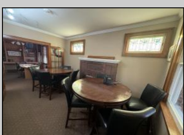
5467 Harding Hwy Mays Landing, NJ 08330