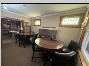
5467 Harding Hwy Mays Landing, NJ 08330