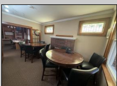
5467 Harding Hwy Mays Landing, NJ 08330