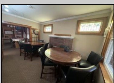
5467 Harding Hwy Mays Landing, NJ 08330