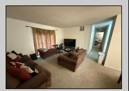
25 Liberty Galloway Township, NJ 08205