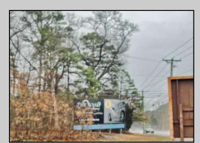
45 White Horse Galloway Township, NJ 08205