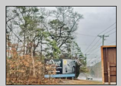
45 White Horse Galloway Township, NJ 08205