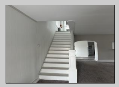
308 Shadeland Pleasantville, NJ 08232