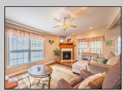
216 Burning Tree Mays Landing, NJ 08330