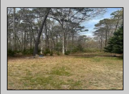
535 6th Galloway Township, NJ 08205