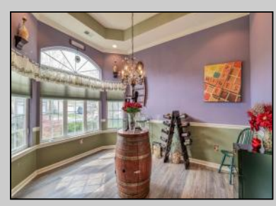
20 Ernst Hamilton Township, NJ 08330